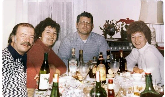
Family time in Freeport